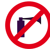
RATTLES OR KLAXONS