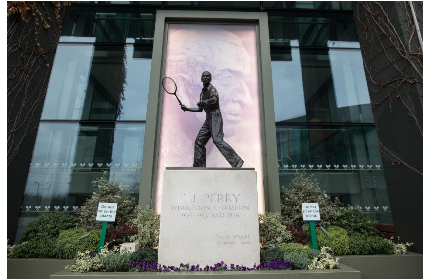
Centre Court Meeting Point

You will be met by a member of staff at either one of these places who will accompany you on your visit