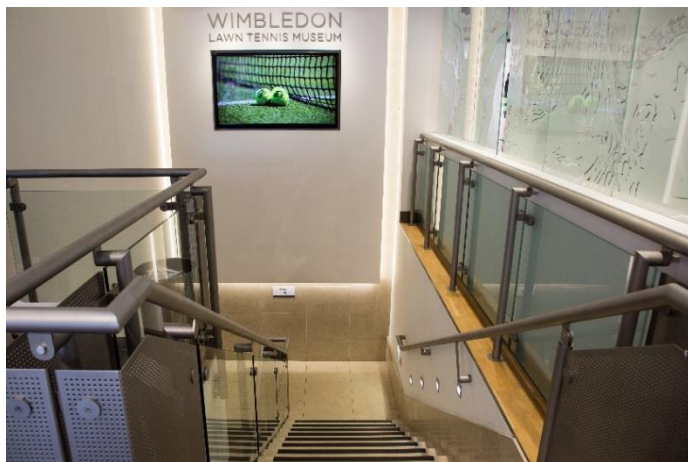
Stairs to Museum