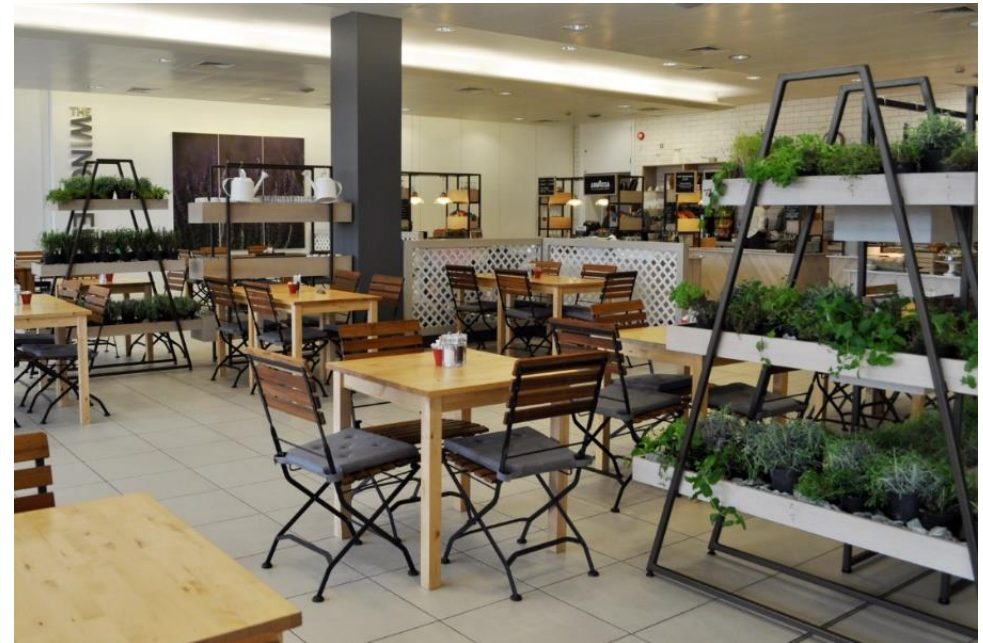
Visit the Wingfield Cafe located opposite the Museum