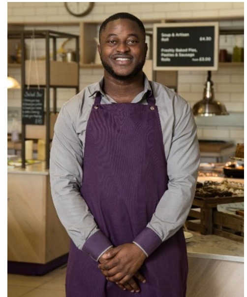
Food Service Assistants