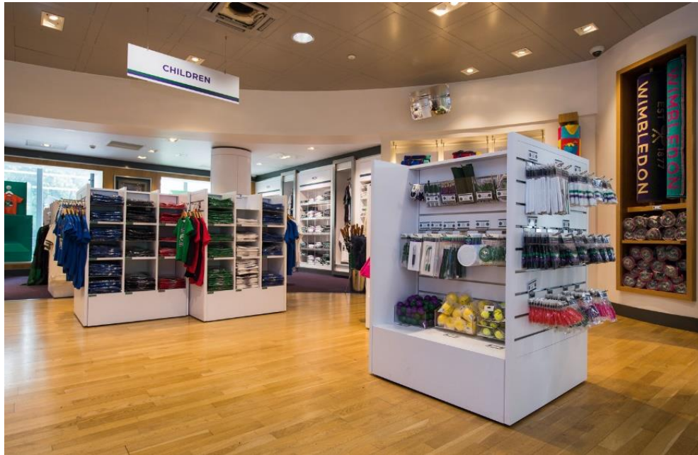
Visit the Shop