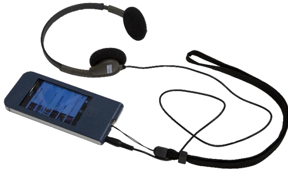
Free audio guide