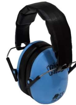
Ear defenders for children and adults