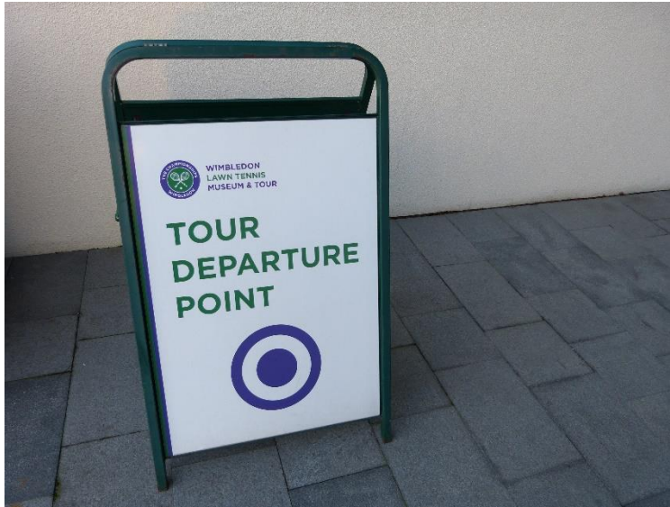
Tour Meeting Point