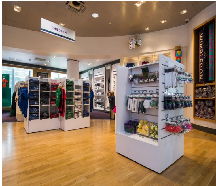
Visit the Shop