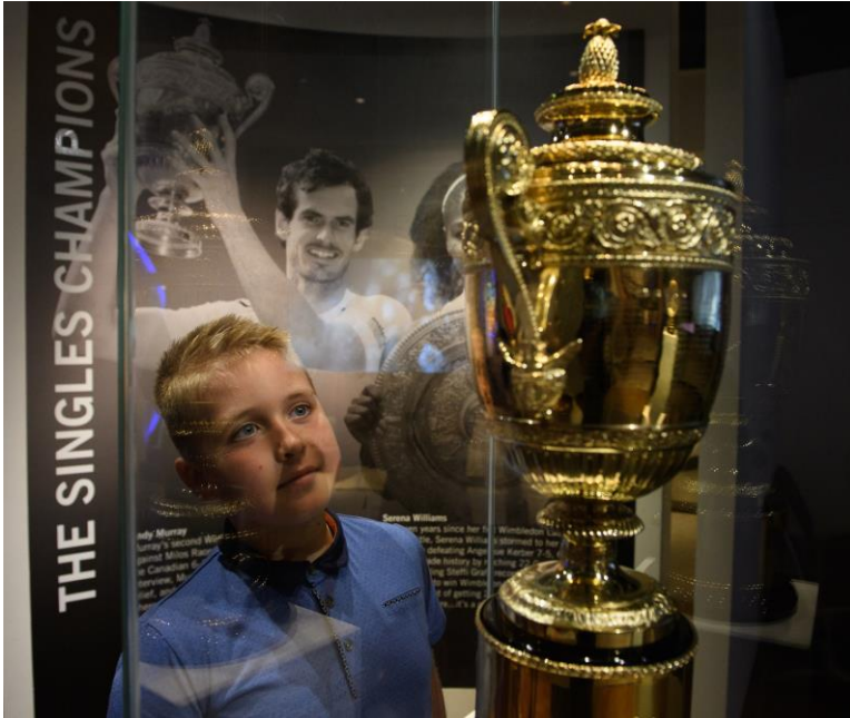
Visit the Museum