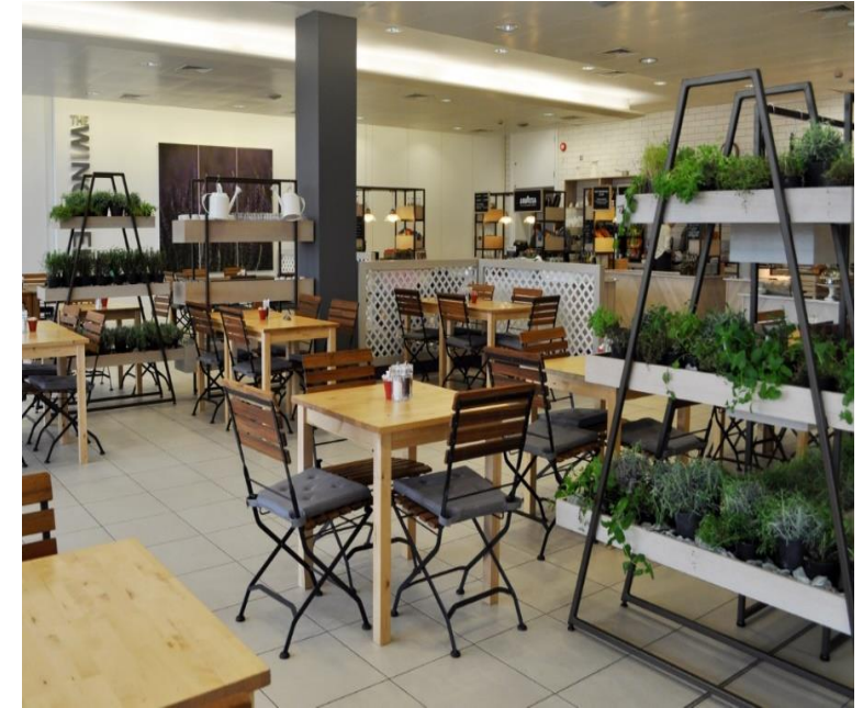
Visit the Wingfield Cafe