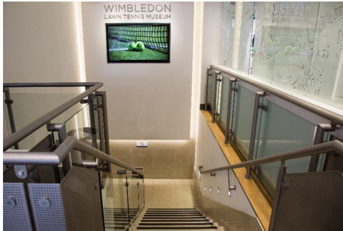
Stairs to Museum