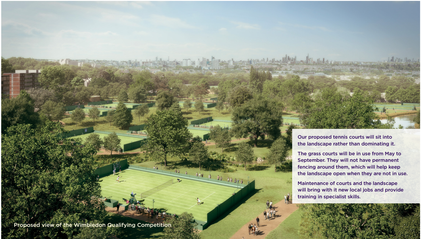
Proposed view of the Wimbledon Qualifying Competition

Our proposed tennis courts will sit into the landscape rather than dominating it. The grass courts will be in use from May to September. They will not have permanent fencing around them, which will help keep the landscape open when they are not in use. Maintenance of courts and the landscape will bring with it new local jobs and provide training in specialist skills.